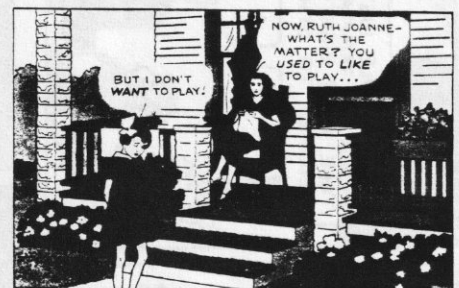
"It was almost impossible to get along with her. You couldn't look at her without her crying. She didn't want to play . . .