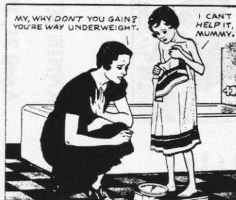
"I did everything but she kept right on losing weight. She was only a shadow of her old self . . .