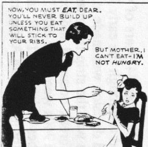
" . . . she ate hardly any solid food. I tried filling her up on milk. It didn't help . . .