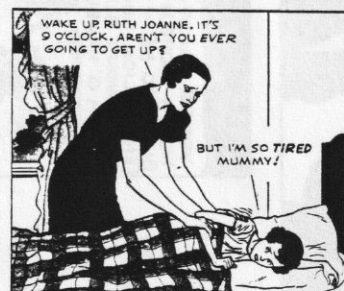
"At night—she slept restlessly. She would often wake us up. In the morning she was tired . . .