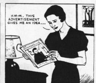
"One day I read an advertisement for Ovaltine. Right then I made up my mind . . .