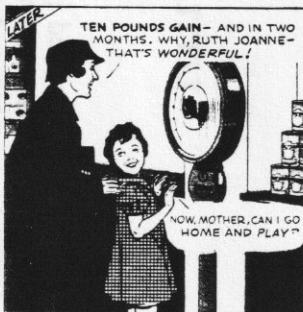
"She picked up at once. It gave her an appetite. The doctor says 'She's so healthy!'"