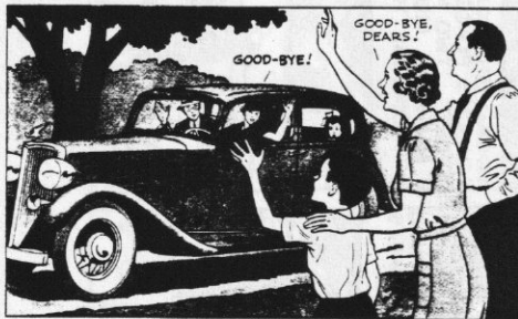
" . . . later, after she began to feel better, we came home. But she couldn't pick up. Just moped around—had no pep . . .