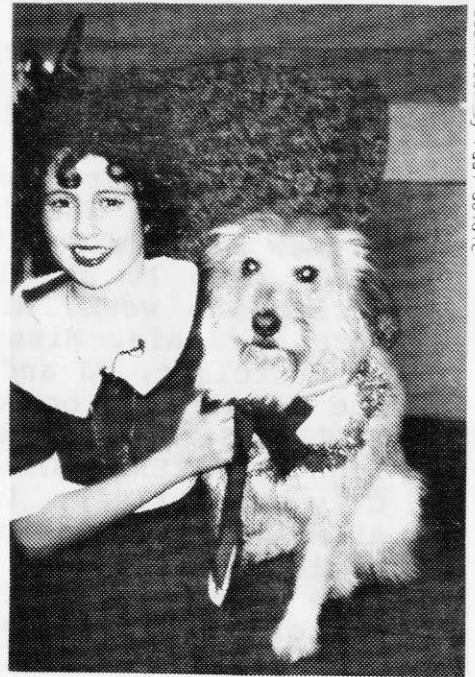
Submitted by Paul Goldie