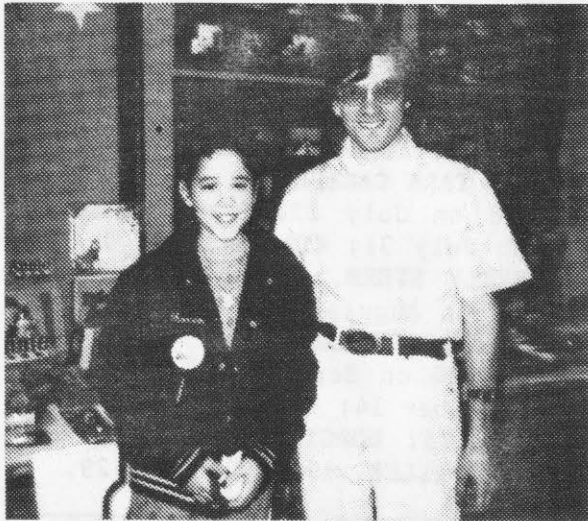
Submitted by Lowell Kammer