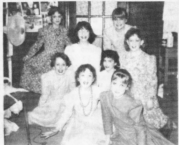
Submitted by Larry Skrdla