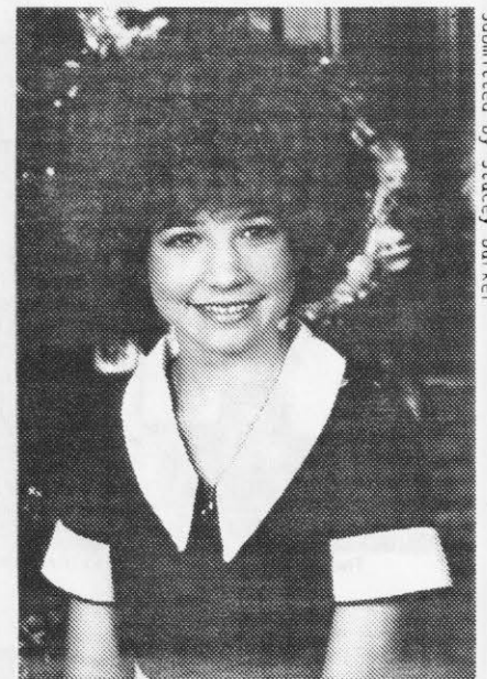
Submitted by Stacey Barker