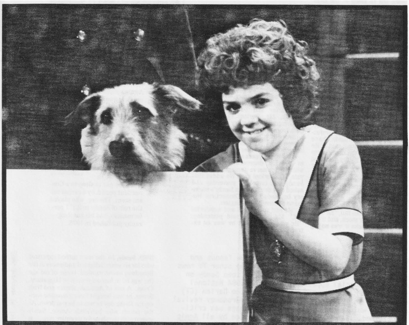
From the Washington, D.C. pre-Broadway tryout of Annie at the Kennedy Center, March 1977.

Annie People is published every other month in January, March, May, July, September, and November. Publication has been continuous since January 1983.