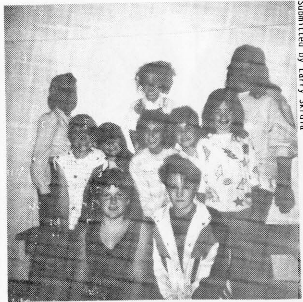
Submitted by Larry Skrdla