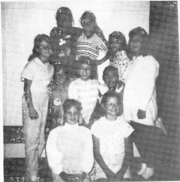
Submitted by Larry Skrdla