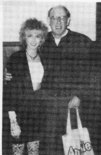
March 1987 - 6 -