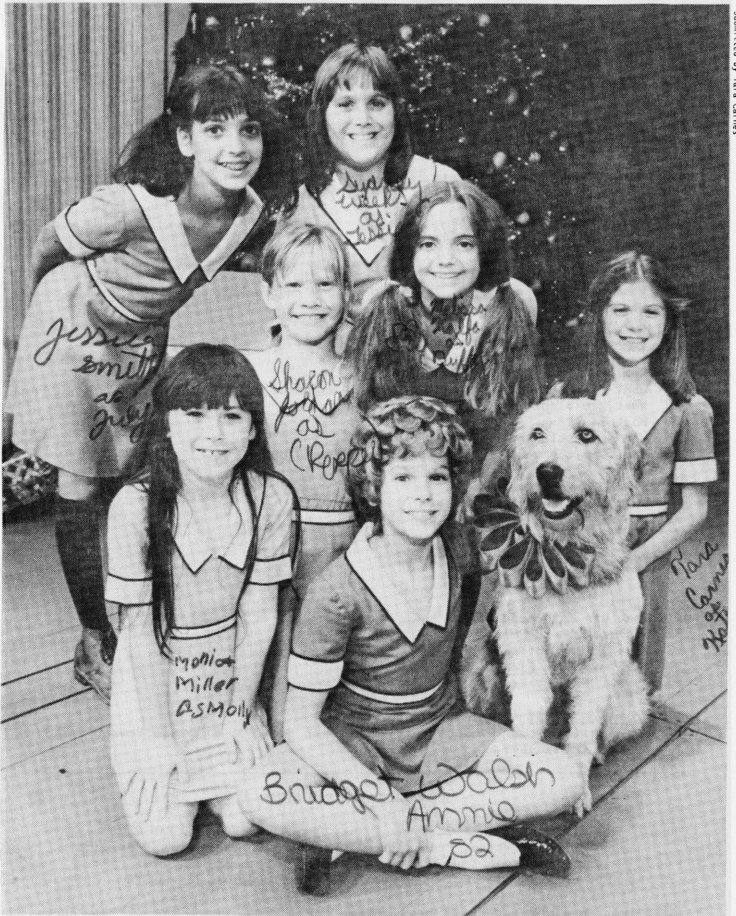
3RD NATIONAL TOURING COMPANY, 1982