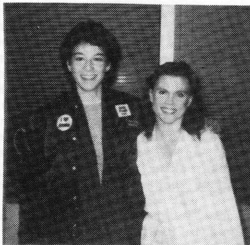
Tricia with Ann Reinking Sweet Charity Broadway, NYC January 1987

***LATEST WORD ON THE BROADWAY SEQUEL***