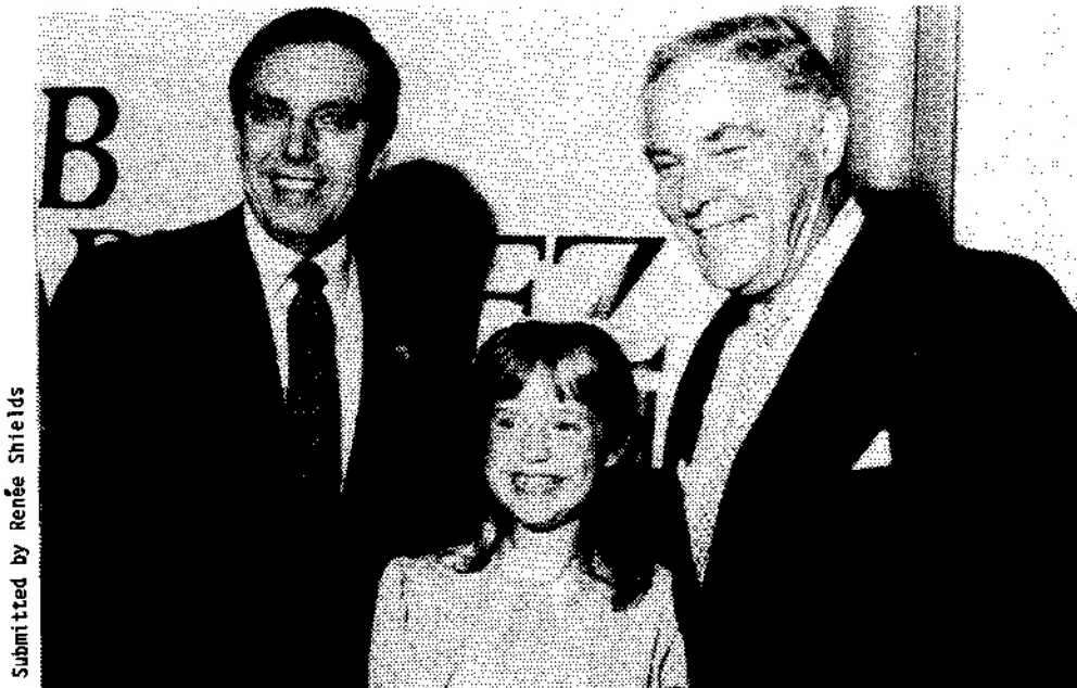
Submitted by Renée Shields