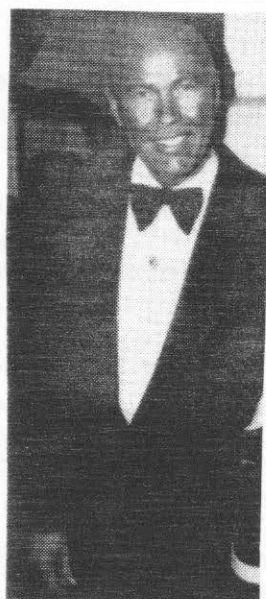
Harve Presnell as "Daddy" Warbucks