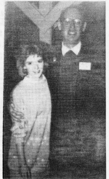
With Allison Smith at Kate and Allie Ed Sullivan Theatre, NYC, Dec. 1985