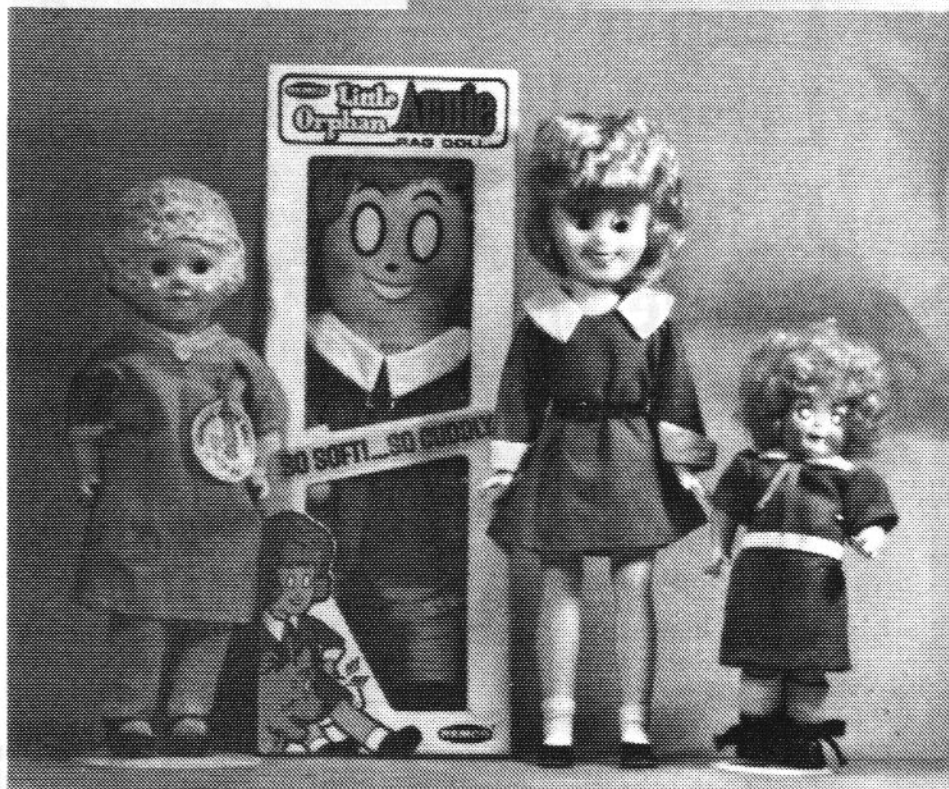
Above: two wind-up tin toys from the 1930s. Sandy is missing the suitcase he should be holding in his mouth. Annie really "jumps" the tin rope. Next are two Christmas tree lights painted in very pale tones to let the light shine through. Left: A 14" 1930s composition doll wearing her original dress and hang tag. (Composition is a ground-wood mixture which can be highly glazed and painted.) The 15" Remco "Raggedy Ann" style doll came in a colorful box in 1967, the same year Remco also made this 15-1/2" plastic doll with rooted hair and "googly" eyes. A New Jersey artist made an all-porcelain 10" doll in 1985. Below: This complete set of Rummy Cards showing comic strip scenes from Whitman Publishing came in two different boxes in 1935 and 1937.